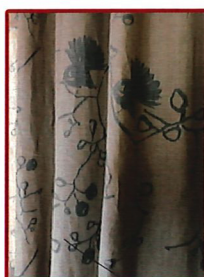
Fantails - Hemptech